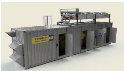
Island mode system: container solution